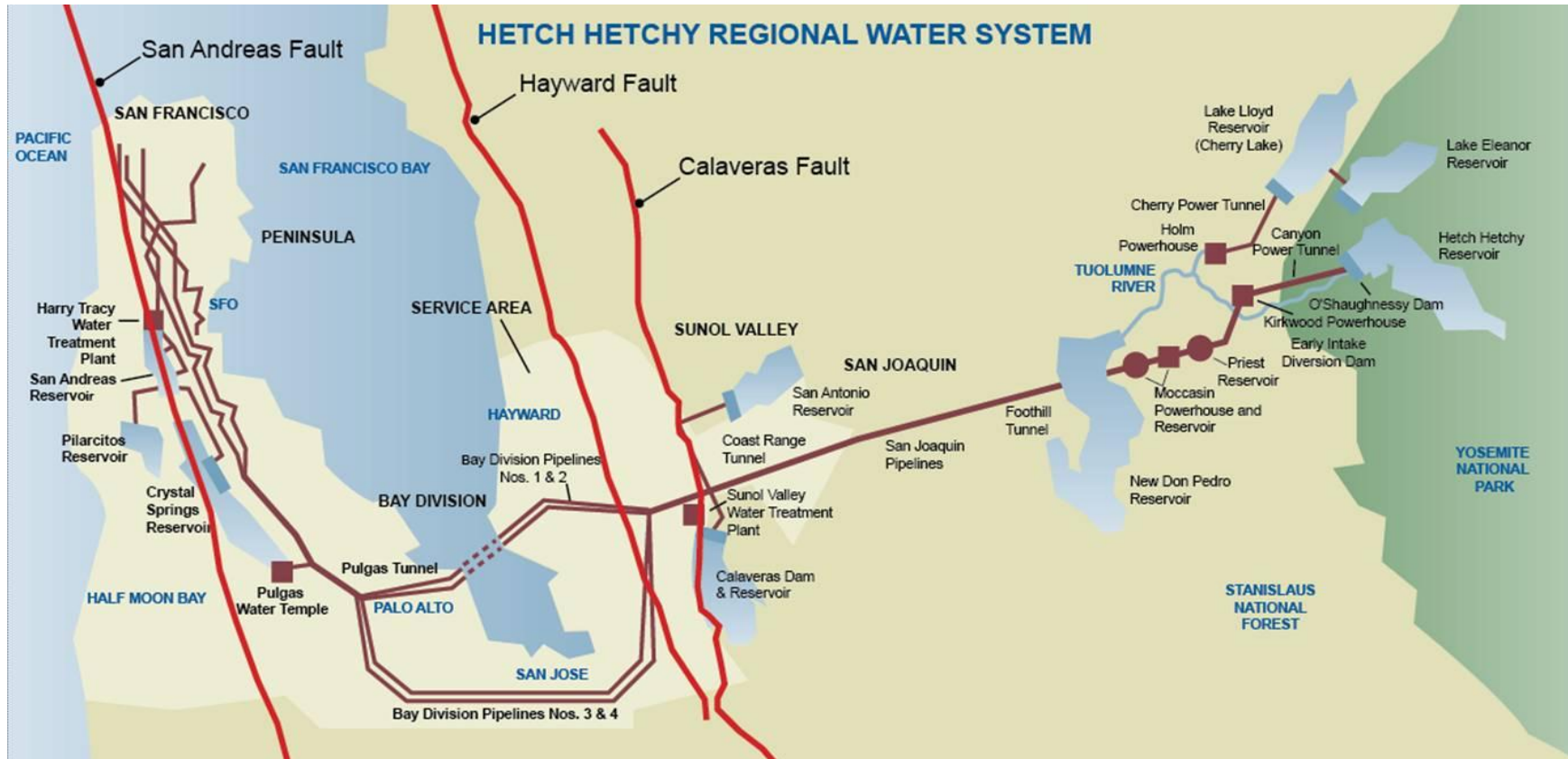
Figure 1-1 (Not to Scale) – The above map depicts the San Francisco Regional Water System.