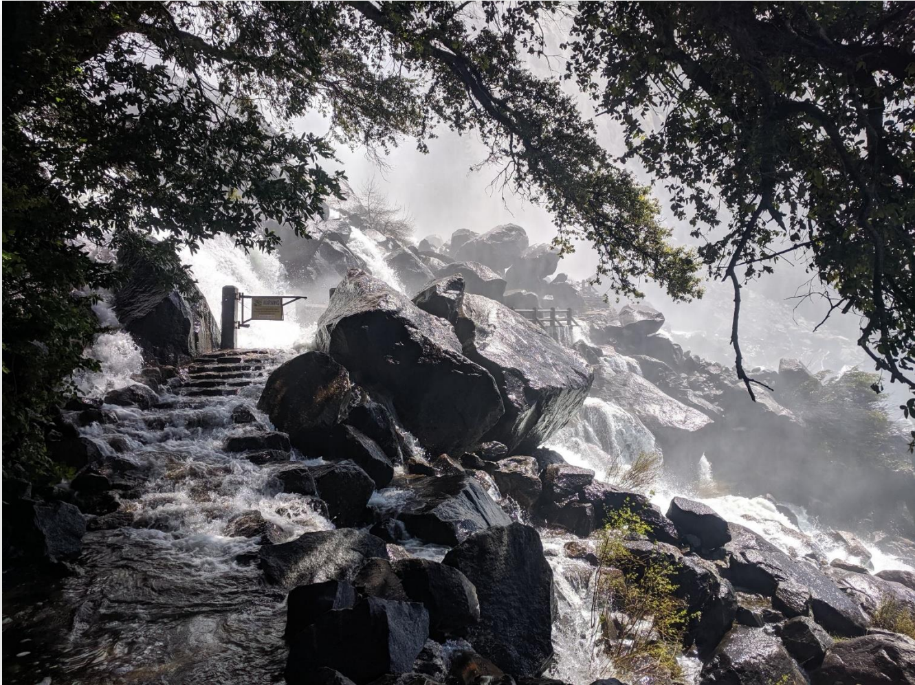
S. Ritchie, 2019