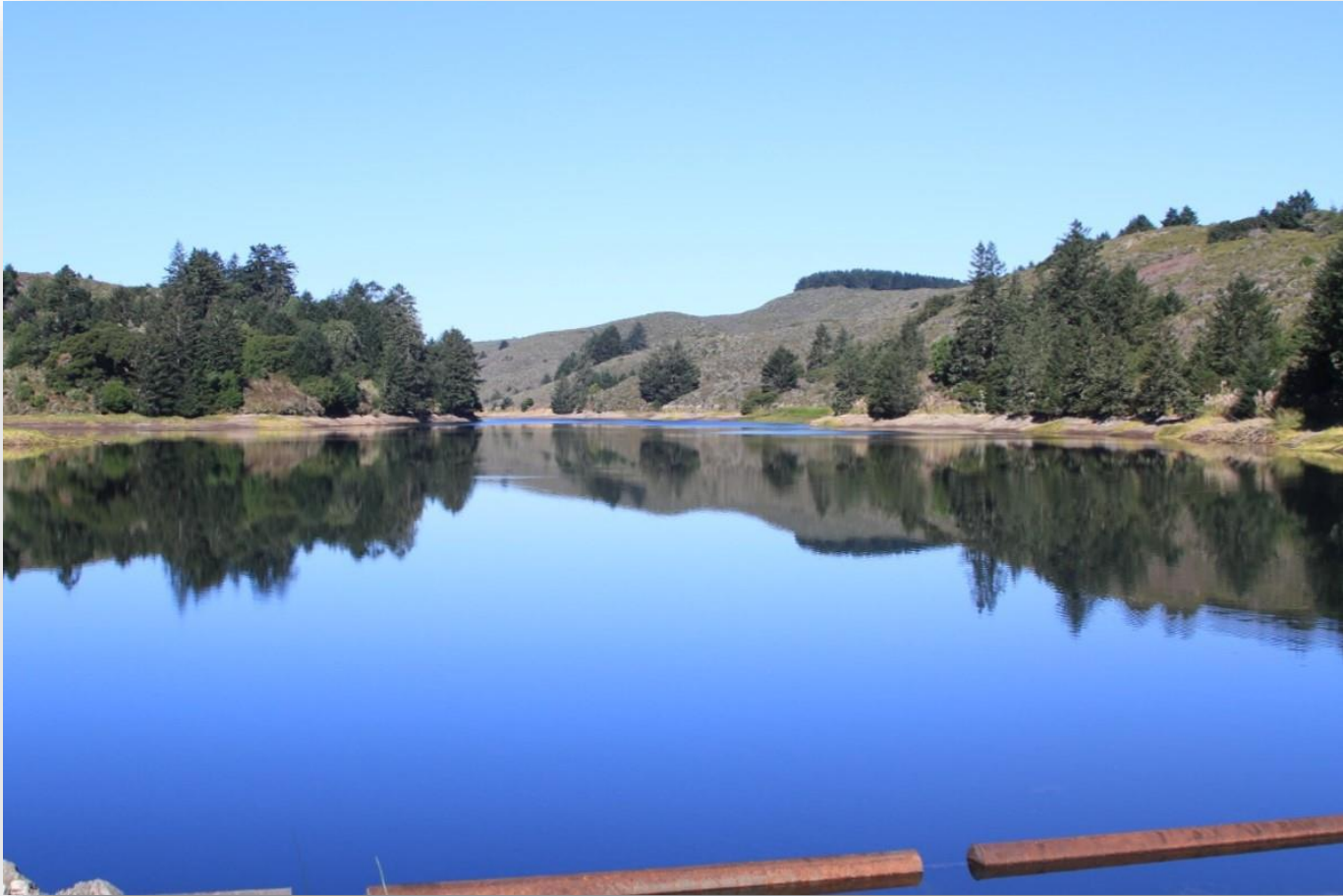
L. Ash, 2017