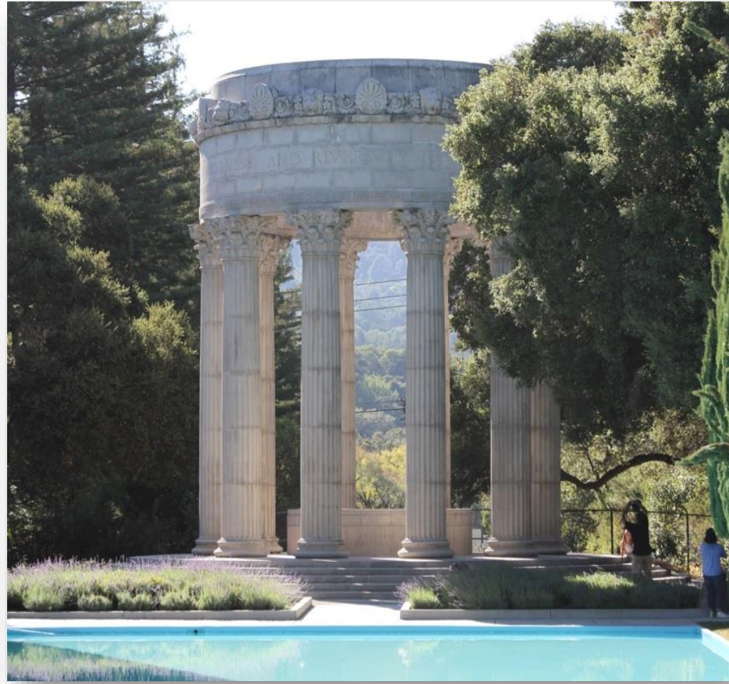
L. Ash, 2017