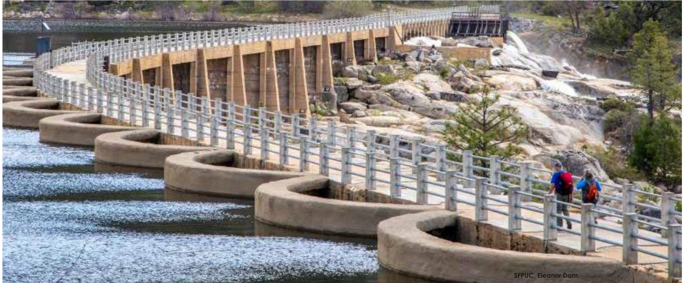
SFPUC, Eleanor Dam